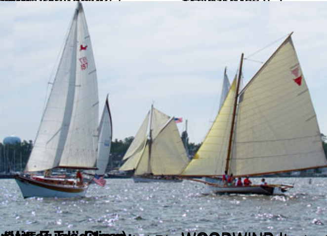
19th Century "Class" WOODWIND