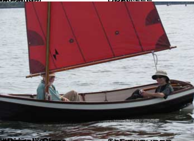
19th Century Whaler BUCKBURN