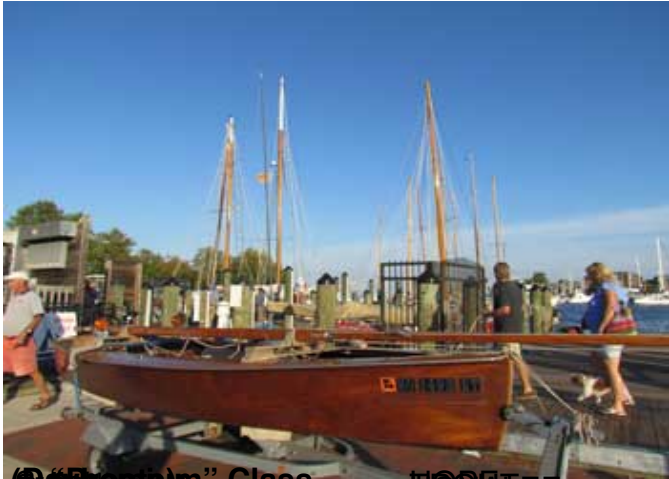
47-foot class HONALEE